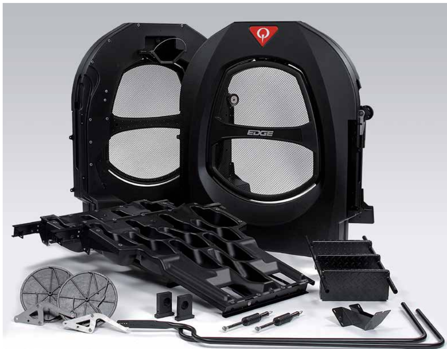
EDGE Pinspotter Upgrade with Durabin - Upgrade Contents

This one-piece bin has no metal parts to damage pins. Plus, unlike a mechanical switch, the optical switch does not contact and wear pin heads.