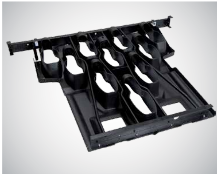
Steel Support Frame