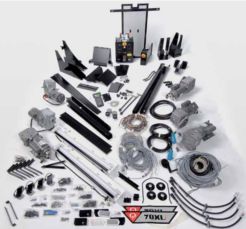
XLi Pinspotter Upgrade for 82-70 Pinspotters - Upgrade Contents*

These are added to the front and rear of each pair of pinspotters to give technicians a quick and safe way to stop them in the case of emergency.