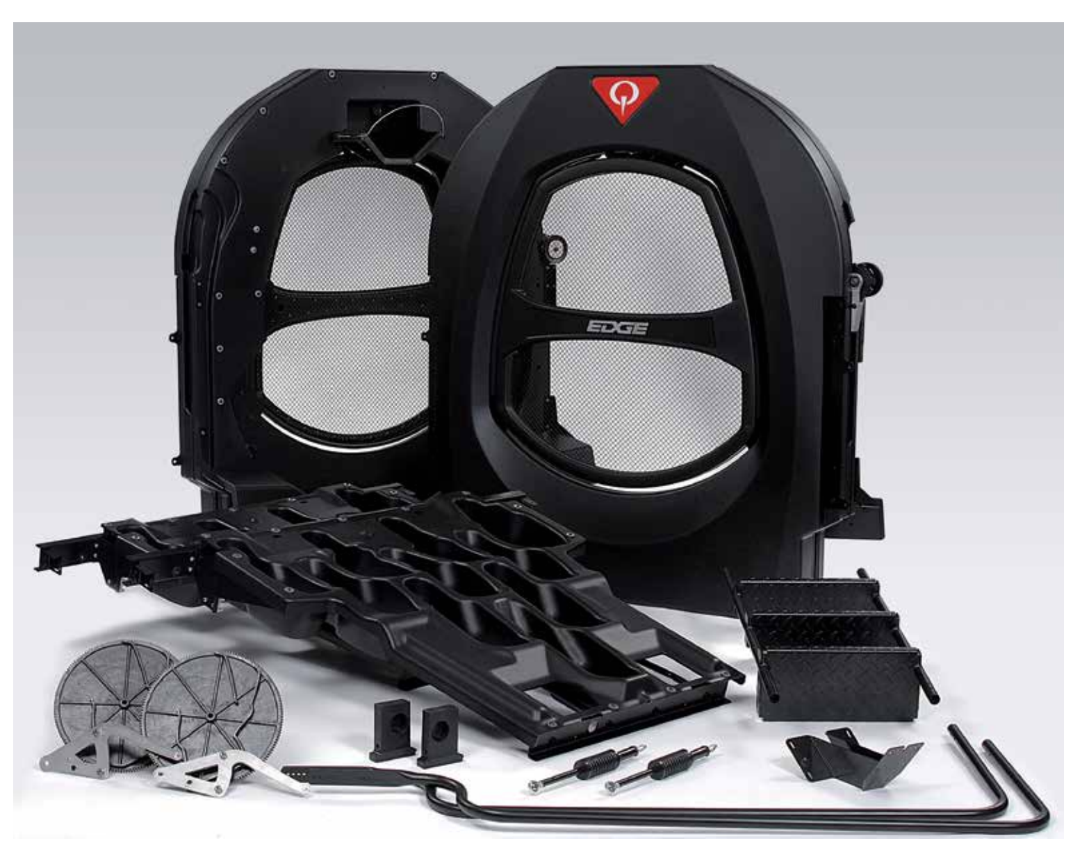
EDGE Pinspotter Upgrade with Durabin - Upgrade Contents