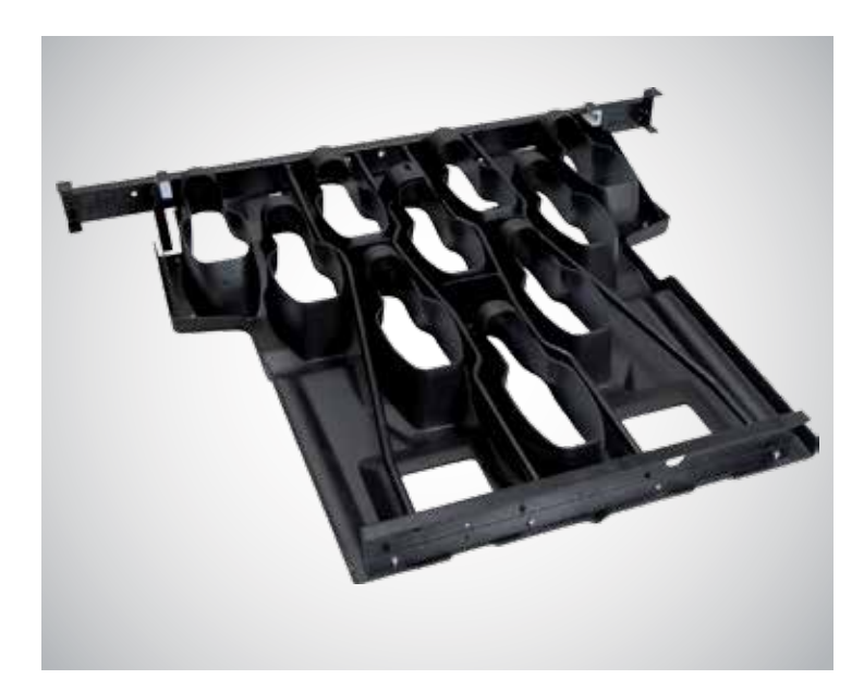
Steel Support Frame