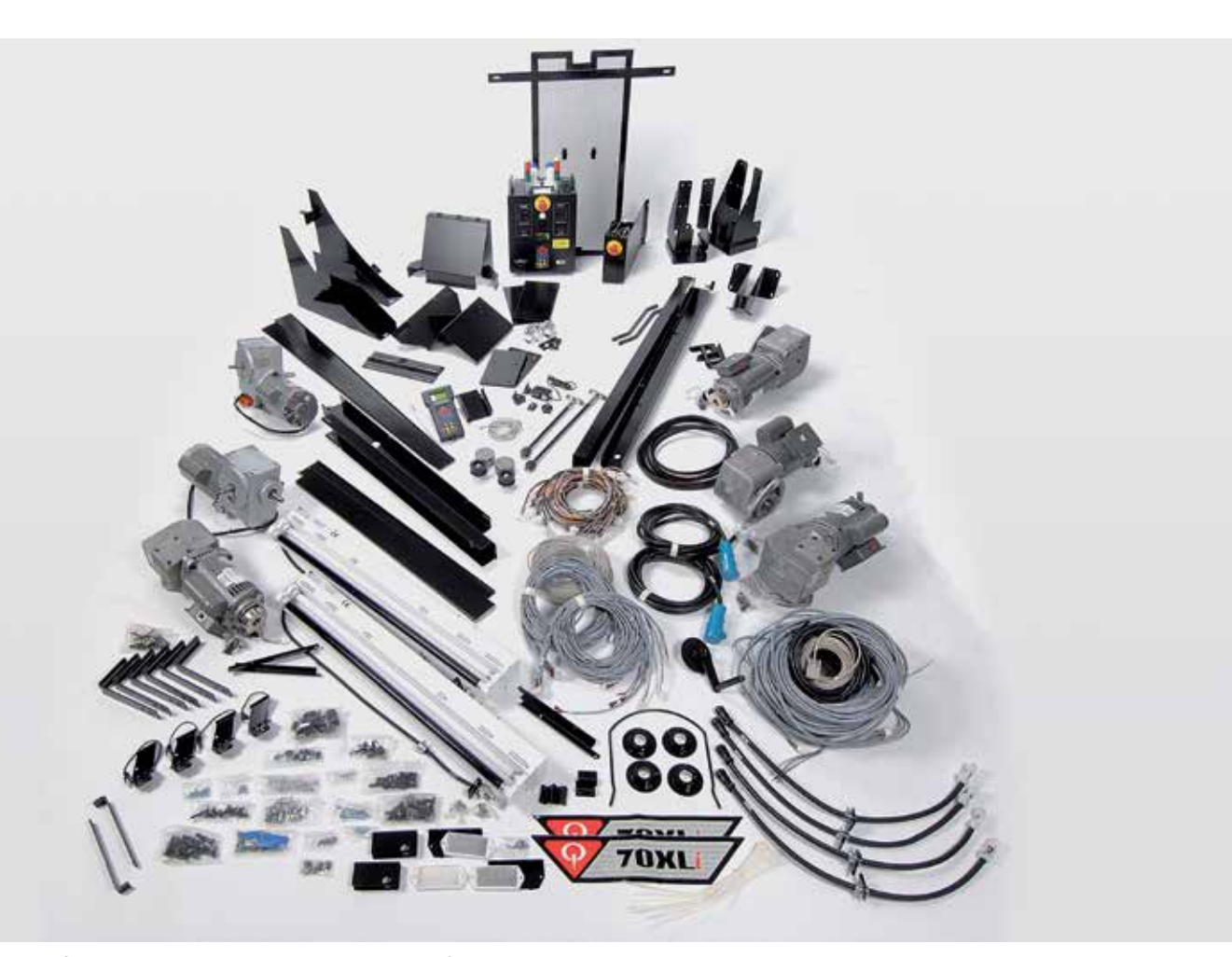
XLi Pinspotter Upgrade for 82-70 Pinspotters - Upgrade Contents*