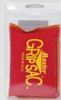
V165 | GRIP SAC