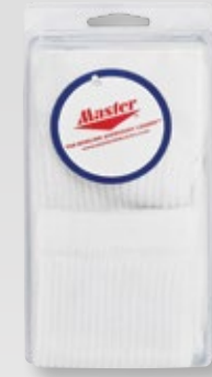
V2900 | MENS CREW SOCK