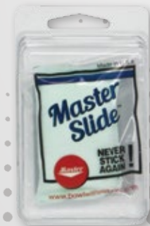
V135 | MASTER SLIDE™