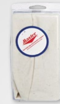
V149 | BUFF-A-BALL™