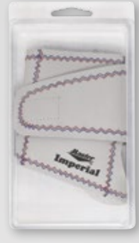
V48 | IMPERIAL WRISTLET