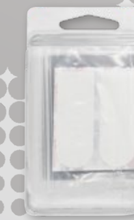
V242.WHT - WHITE