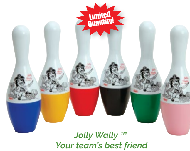
Jolly Wally™ Your team's best friend