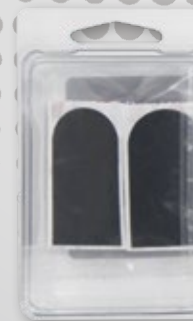
V242.BLK - BLACK