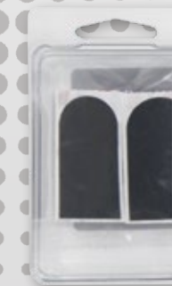
V241.BLK - BLACK