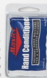
V162 | HAND CONDITIONER