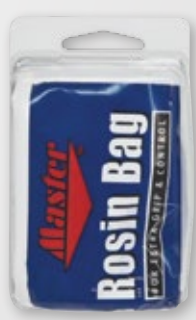
V160 | ROSIN BAG