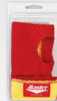
V73 | WRIST GUARD™