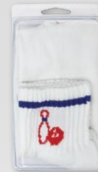
V2100 | LADIES BOWLING SOCK