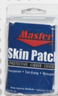
V154 | SKIN PATCH™