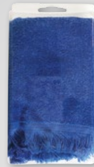
V307 | COLORED TOWEL