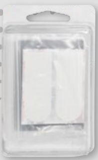
V241.WHT - WHITE