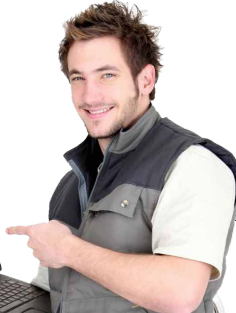
Quick Start Guide and Training Video