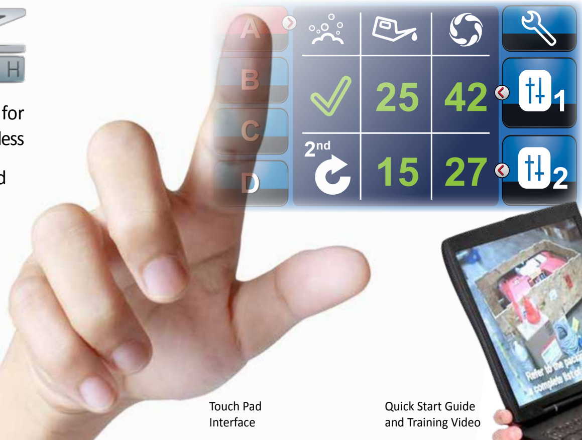
Touch Pad Interface

The smartest choice for centers of 16 lanes or less —specifically designed around your needs