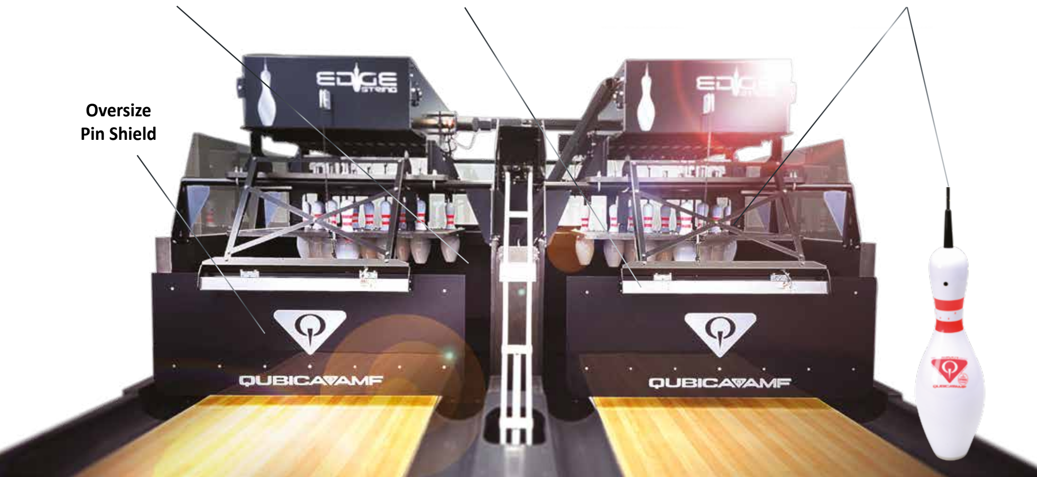
Oversize Pin Shield