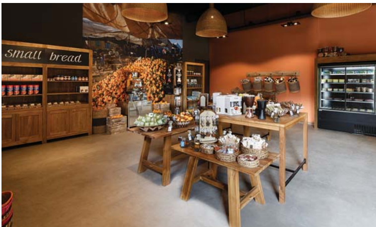
The on-site market in Karibu Town

Niels de Wildt says, "Beekse Bergen guarantees a unique, high-quality one-day and overnight safari recreation in the Netherlands. The opening of the resort reinforces the (multi-day)