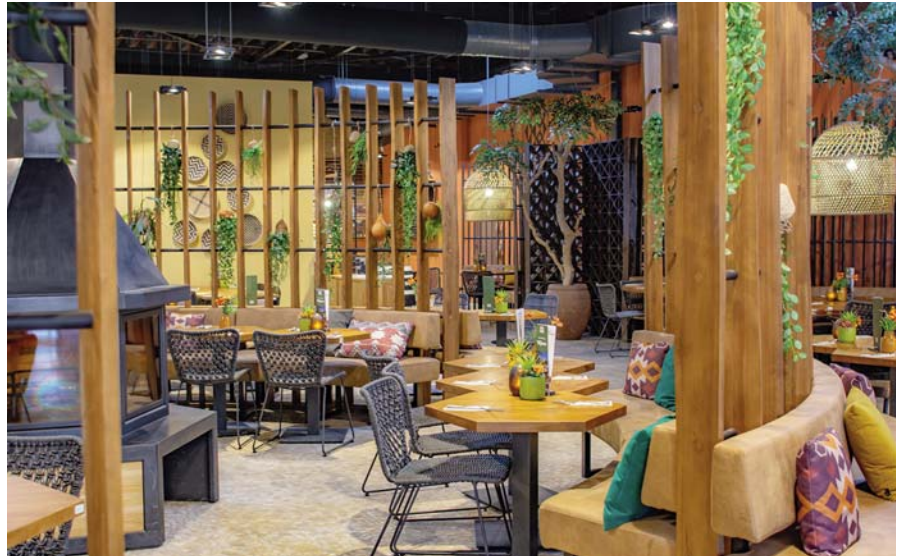
The Restaurant Moto