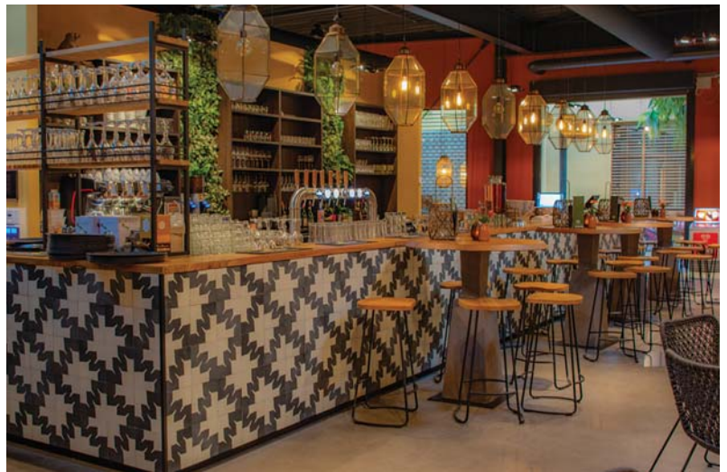
The Pamoja Lounge is a casual bar next to the bowling lanes

residential tourism and employment in Brabant province Presently, there are about 600 full- and part-time employees at Beekse Bergen, a number which will increase as there are plans for a Phase II Expansion to the Safari Resort in terms of accommodation and activities."