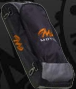
ITEM NUMBER: MTVG0BXKO