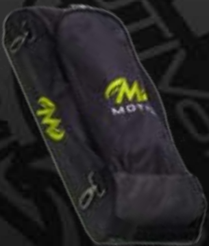
ITEM NUMBER: MTVG0BXGL