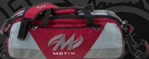
ITEM NUMBER: MTVG3BXRD