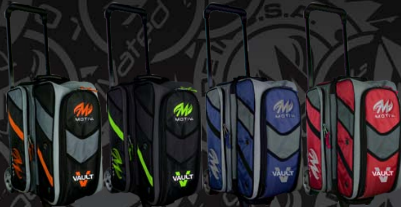
ITEM NUMBER: MTVG204KO