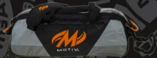
ITEM NUMBER: MTVG3BXKO