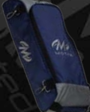
ITEM NUMBER: MTVG0BXNV