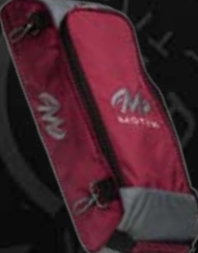
ITEM NUMBER: MTVG0BXRD