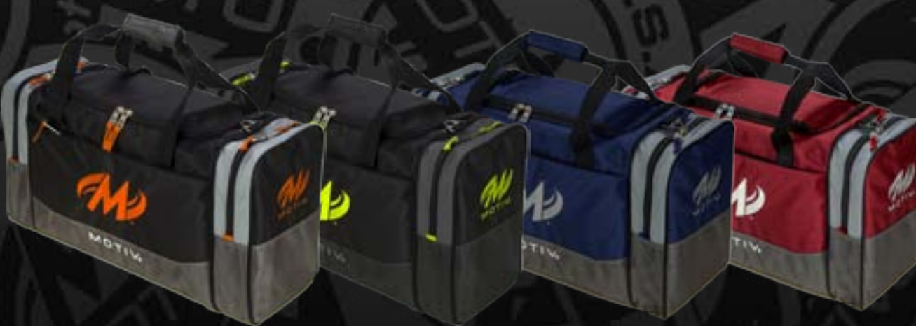
ITEM NUMBER: MTVG205KO