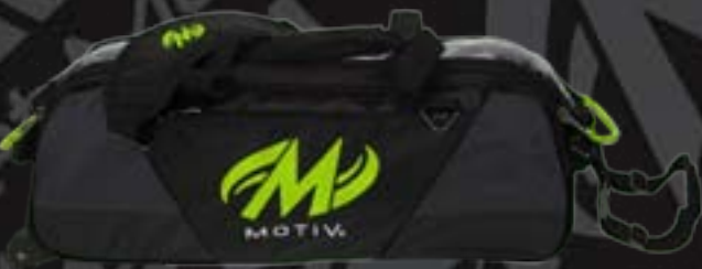
ITEM NUMBER: MTVG3BXGL