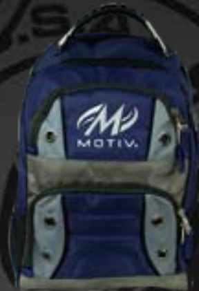
ITEM NUMBER: MTVG005NV