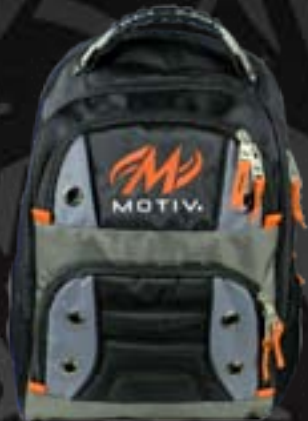
ITEM NUMBER: MTVG005KO