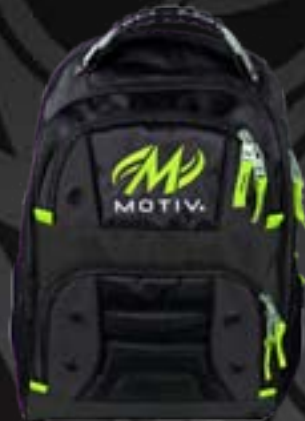
ITEM NUMBER: MTVG005GL