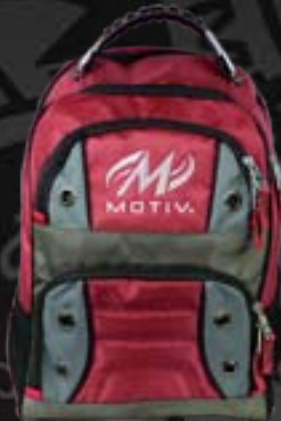
ITEM NUMBER: MTVG005RD