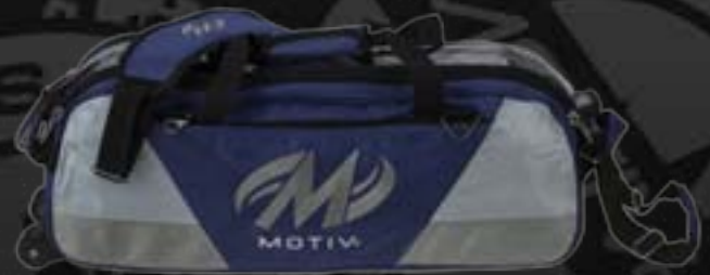
ITEM NUMBER: MTVG3BXNV