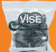
SWITCH GRIP TO IT CONVERSION SLEEVES