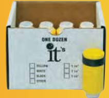
EASY SLUG / SLUG-IT / TOP SLEEVES / SLUG-IT SAFETY MOLLIES