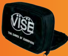
IT SMALL ACCESSORY BAG