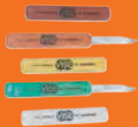
VISE TAPING KNIFE AVAILABLE IN RED, ORANGE, YELLOW, GREEN & WHITE