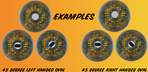
45 DEGREE LEFT HANDED OVAL