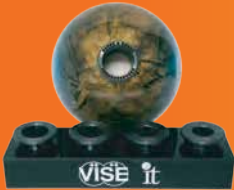
FERRARI BALL JIG