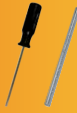
IT SCREW DRIVER & PUSHDOWN ROD