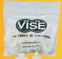
SLUG-IT SAFETY MOLLIES