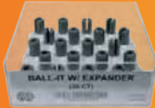
BALL-IT W/ EXPANDERS 20CT