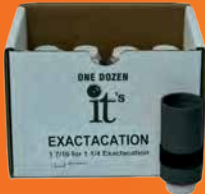
EXACTACATION RECEIVING SLEEVES W/ TOP SLEEVES