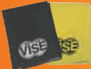
VISE WOW! AVAILABLE IN BLACK & YELLOW