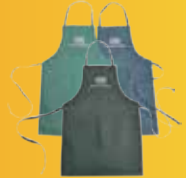
VISE SHOP APRON AVAILABLE IN BLACK, DARK GREEN & NAVY