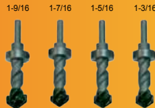
IT DRILL BITS