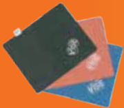
VISE SUPER CLOTH AVAILABLE IN BLACK, RED & NAVY