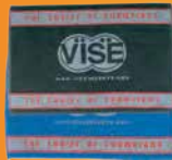
VISE TOWEL AVAILABLE IN BLACK & BLUE