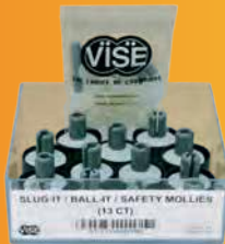
SLUG-IT / BALL-IT / TOP SLEEVES / SLUG-IT SAFETY MOLLIES 13CT