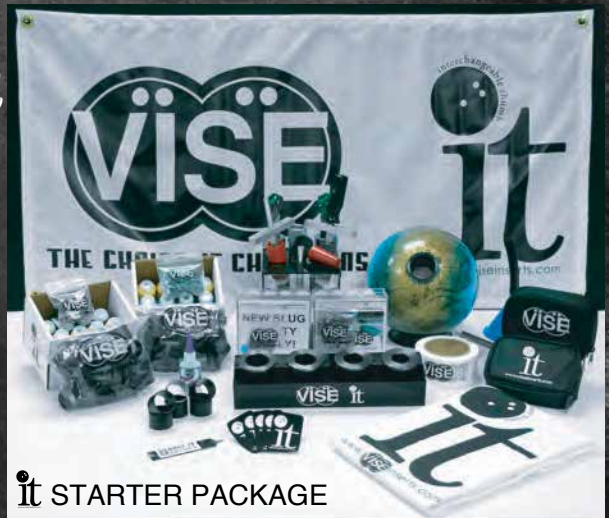
it STARTER PACKAGE