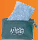
VISE NON-SLIP POWDER POWDER COMES IN A BLACK ZIPPER POUCH REFILLS ALSO AVAILABLE