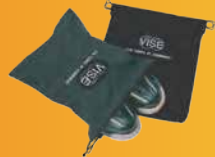
DELUXE SHOE/BALL BAG AVAILABLE IN BLACK