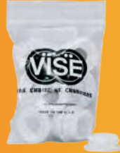
SLUG-IT W/ WASHERS ALSO AVAILABLE NOTCHED