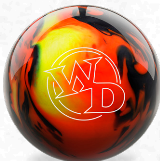
LAVA (AVAILABLE IN 16LBS*)