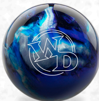
BLUE/BLACK/SILVER (AVAILABLE IN 16LBS*)