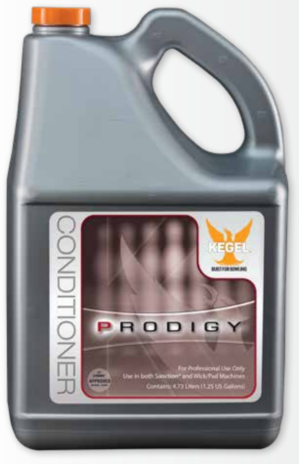
KEGEL - Prodigy

THE 'all-time favourite' lane conditioner, from it's release date in 2004, until today the Prodigy is a true bestseller! This conditioner delivers consistent scoring and a predictable ball motion while the back-end reaction just won't go away. Reduced carry down, easy to clean and suitable for all surfaces.